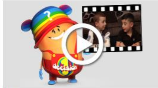
Video - Friendship