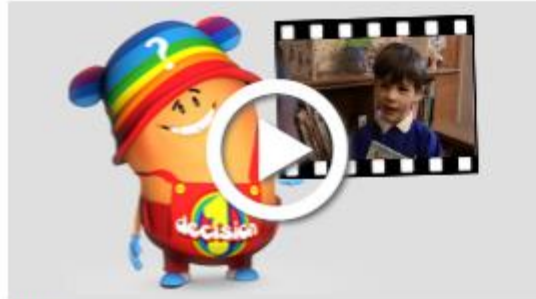
Video - Bullying