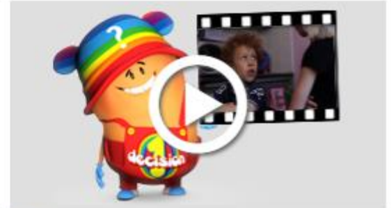
Video - Touch