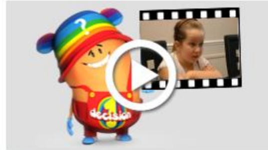
Video - Body Language