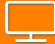
Lesson Guide - Body Language