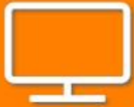
Lesson Guide - Bullying